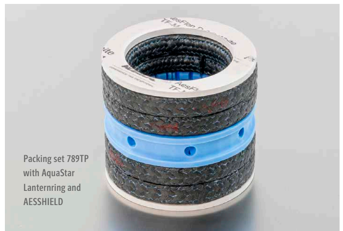
Packing set 789TP with AquaStar Lanternring and AESSHIELD

All technical information and advice is based on our experience and will be given most conscientiously but without any liability.