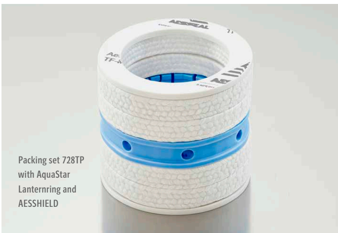
Packing set 728TP with AquaStar Lanternring and AESSHIELD